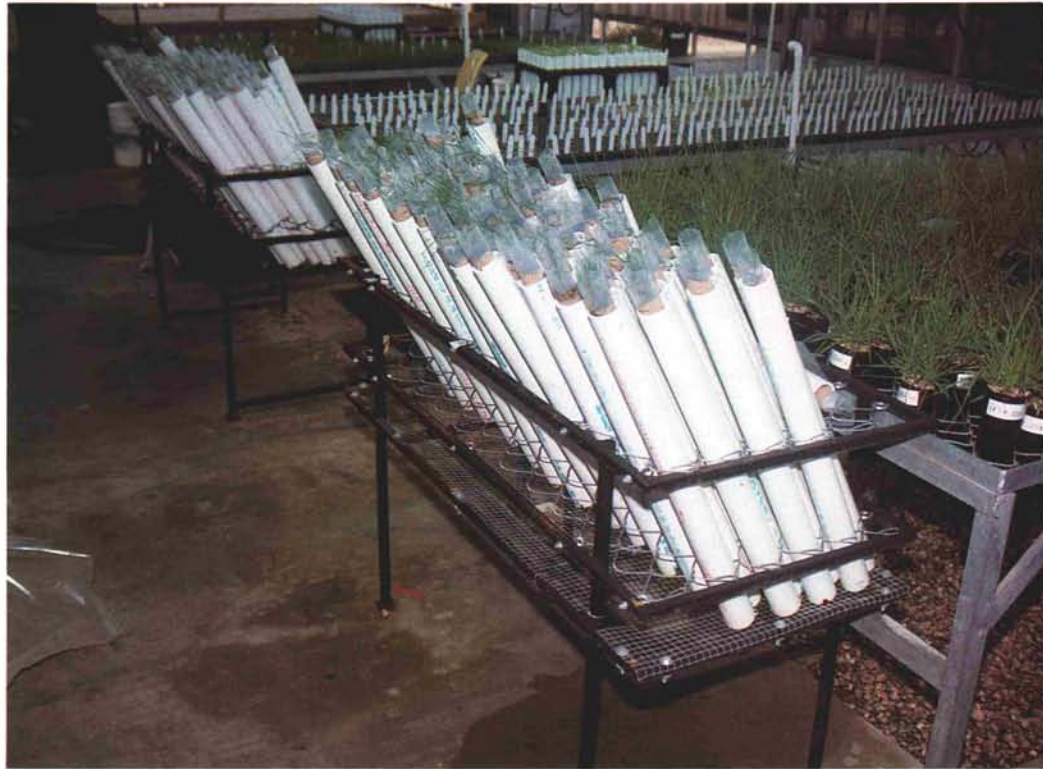
Root distribution influences the ability of the turf to access soil moisture reserves. Slanted root tubes aid in studying root distribution and rate of development.

CRENSHAW creeping bentgrass was tested as SYN3-88 and has been licensed to Loft's Seed, Inc., Bound Brook, New Jersey. The variety was named after Ben Crenshaw, a Texas native who has a keen interest in the development of improved grasses and who followed the progress of SYN3-88 for several years. CRENSHAW has had substantial success on several golf courses in the southern United States, including Lakes Spivey, Jonesboro, Georgia (1991); Chapel Hill Golf Club, Douglasville, Georgia (1992); Bogey Hills Country Club, St. Charles, Missouri (1992); Sherrill Park Golf Club, Richardson, Texas (1992); Kirkwood Plantation Golf Club, Holly Springs, Mississippi (1992); and Chickasaw Country Club, Memphis, Tennessee (1992). CRENSHAW