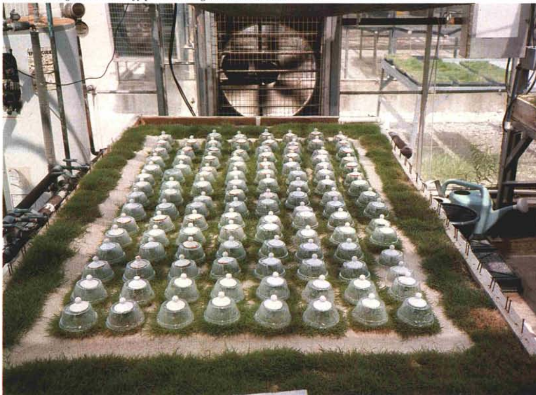
A heat bench was developed at the Texas A&M Research Center—Dallas as a screening tool to identify plants with good root heat tolerance.