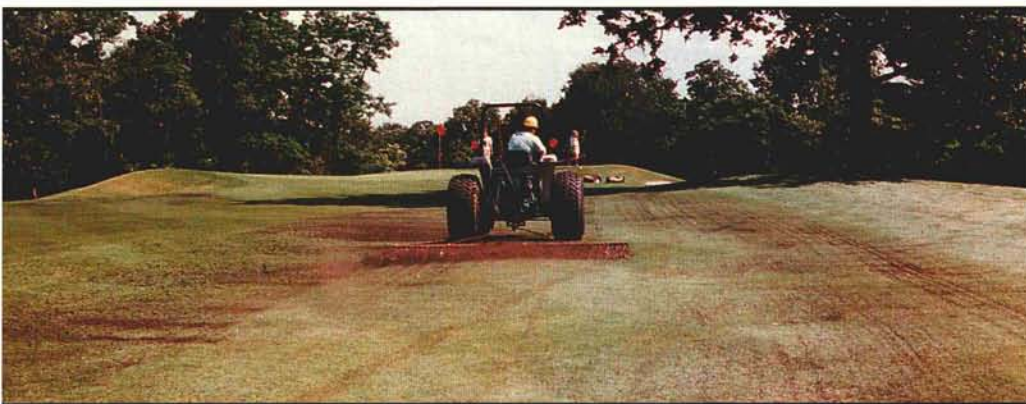
Old Westbury Golf and Country Club (Old Westbury, New York) has an extensive composting facility on-site. A portion of the composted material is used as topdressing on the golf course to improve soil and turf health.