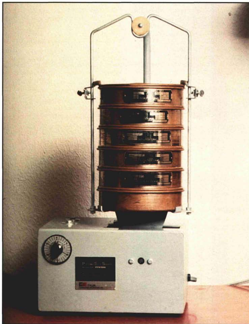
A nest of sieves is mounted on a power shaker like that used by professional labs. This is a nice accessory if you can afford it. If not, manual shaking will suffice.

There are many different methods of sieving. The procedure we use in this office is as follows. Keep in mind that