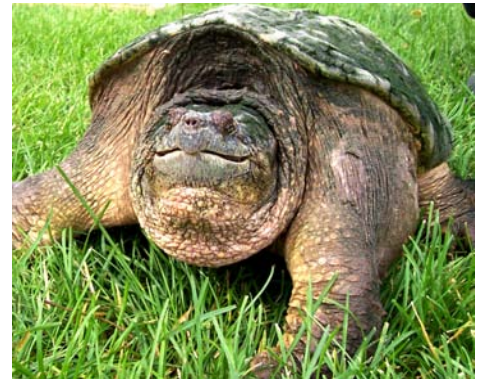
A total of 335 turtles were captured in the initial 3-month trapping period. Of these, 190 (57%) were snapping turtles.

In terms of species composition, golf course wetlands may be more favorable to snapping turtles than to painted turtles. Among wetlands on golf courses, 79% of captures were of snapping turtles versus 49% in urban wetlands and 54% in protected areas. Golf courses had the most favorable sex ratios of snapping turtles