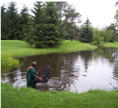
Turtles were trapped with baited hoop nets for three consecutive nights at each site.

During the 2009 field season, we trapped turtles in a total of 75 wetlands ("ponds") from June 1 through August 15 along an urban-rural land use gradient in the vicinity of Syracuse, New York. We characterized the ponds based on an initial assessment of whether they were in primarily "urban", "golf course", or "protected area" contexts. Of these 75 ponds, 32 were on golf courses (42%), 20 were in urban areas (26%), and 25 were in protected areas (32%).