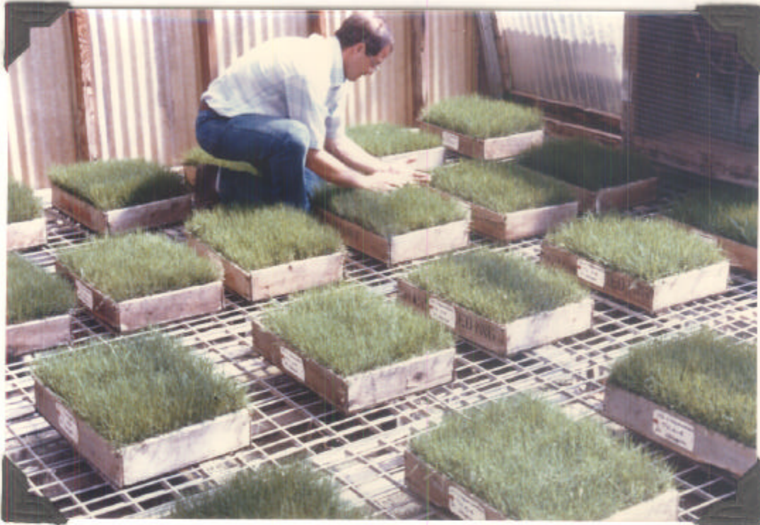
Flats of progeny plants of Cynodon transvaalensis and C. transvaalensis X C. dactylon hybrids. Over 4000 of these plants are being readied for transplanting to the field.