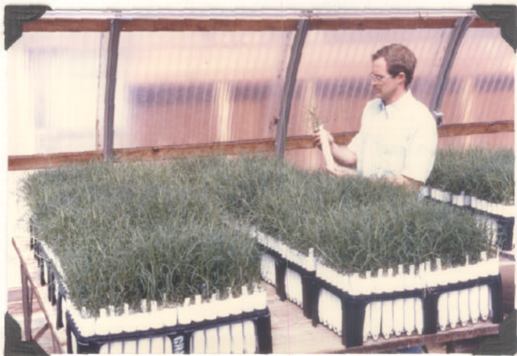
Bermudagrass plants being grown for cold-tolerance screening. Each "conetainer" contains a plant grown from a seedling. These plants will be acclimated in a growth chamber for one month (12 hr photoperiod, 13/6 °C day-night temp.), then screened for cold tolerance using the freeze/regrowth procedure.